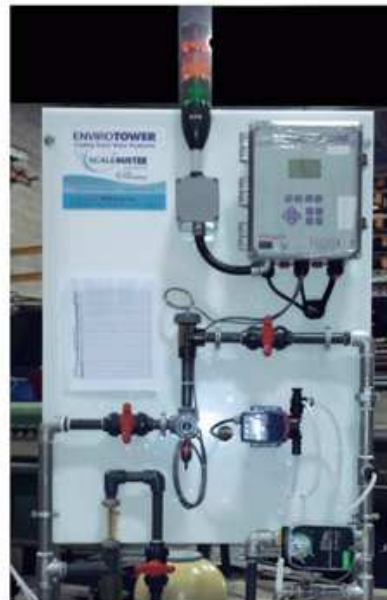
Control Skid Front View

Water softening requires a certain amount of power, either heat power, mechanical power, or electric power. The lowest consumption, and therefore the highest efficiency of CaCO 3 separation is achieved by electric power, which