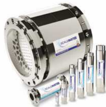
Scalebuster Group Shot